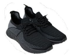
Runners (add photo of new style) Harper